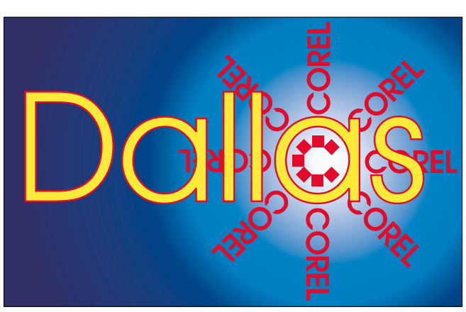
SIG of North Texas PC Users Group, Inc.

There was some discussion and questions on life of ink jet images. Dick is doing a lot of research in this area. One of the discoveries was that the home ozone machines that are supposed to make you feel good along with sunlight are really destructive on ink jet